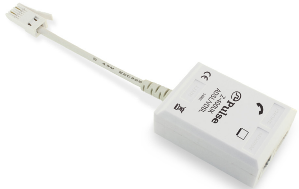
Z-400UK filter provides a DSL convenience jack for connecting a DSL modem

The Z-400UK is a BT SIN498 VDSL2 customer premises equipment filter designed to expedite the service delivery and improve the performance of DSL services over plain old telephone service (POTS) in the United Kingdom. The Z-400UK filters all telephones, and other telephone equipment. Its filter design electronically isolates the high-speed DSL data stream from the voice-band equipment to provide premium voice quality and optimal DSL data rates.